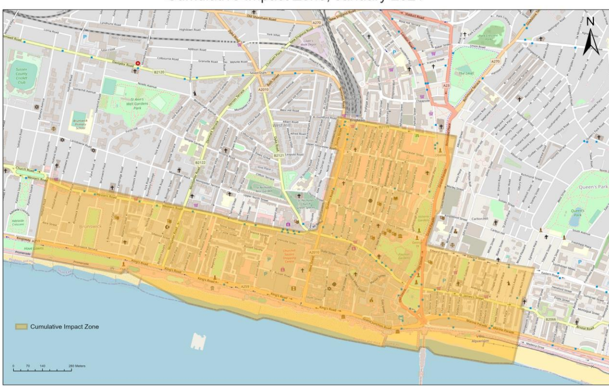
Cumulative Impact Zone, January 2021

3.1.4 This special policy will refer to a Cumulative Impact Zone ("the CIZ") in the Brighton city centre, a detailed plan of which is shown below.